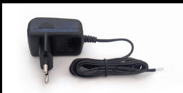
Power supply unit included